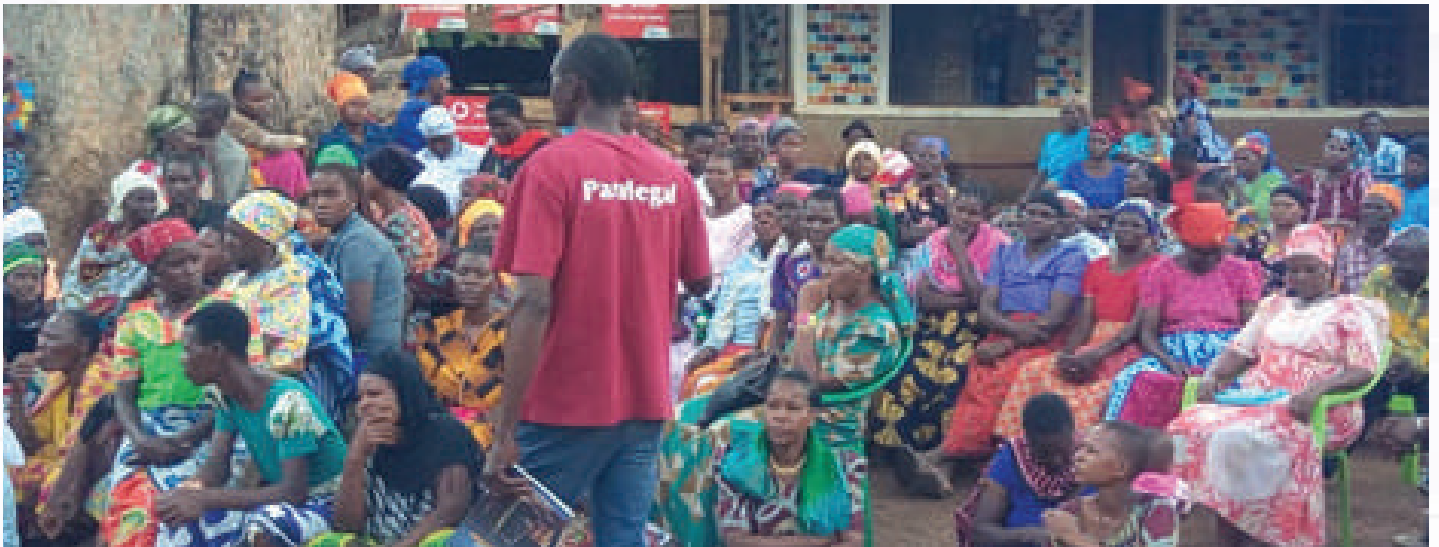
A picture of one of our paralegals holding a community gathering to promote public education on legal aid awareness during the commemoration of Legal Aid Week from March 1 to 2, 2021. Our paralegal was able to deliver this type of education throughout Kilimanjaro's seven districts.

Paralegals in Rombo participated by raising awareness to the community members using different gatherings like women groups, prayer gatherings, market places, and bodaboda stops and at their centers.