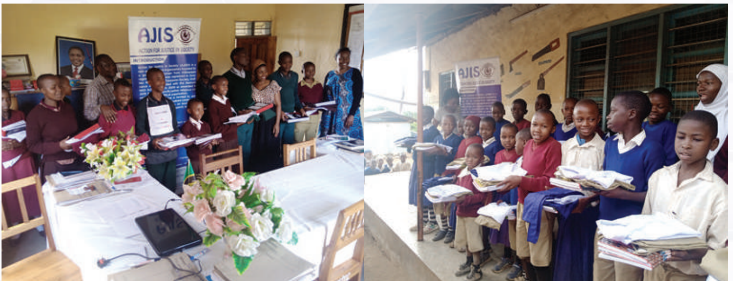
47 members of JALI Watoto Clubs in Ubetu ,Kibaoni Primary School on the left , the uniforms received on the right.

A total number of 56 children were identified and provided with school facilities 14 being secondary school students and 42 primary school students, also reaching out to 98 girls with sanitary pads (86 secondary girls and 12 primary girls). There were about 4 children that were reached directly. To which a total amount of 2,944,000Tsh was spent.