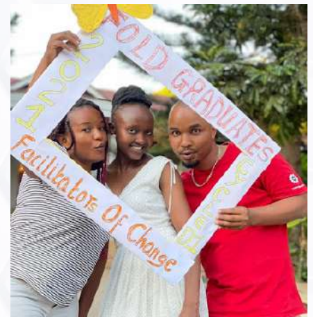
The pictures show some AJISO staff who graduated from FOLD (Facilitator of Organizational Learning and Development) training) together with other graduates.