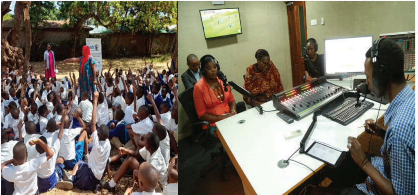
On commemorating 16 days of Activism against GBV that is held from 25th Nov to 10th Dec each year, AJISO staff provided education on Gender-Based Violence to the community via radio programs at Kicheko FM in Mailisita Moshi and to pupils at Muungano and Jamhuri primary schools

AJISO's staff provided education on Gender-Based Violence to pupils at Muungano and Jamhuri primary schools (Neighbor schools) to have awareness on how they can prevent such situations from occurring and what to do and where to report such incidents. Apart from that, we also established child protection clubs that will be capacitated so that they can keep on educating their fellow pupils, community and reporting cases concerning Gender-Based Violence.