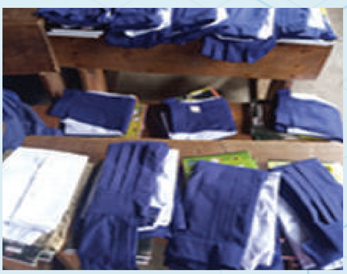
47 members of JALI Watoto Clubs in Ubetu ,Kibaoni Primary School on the left , the uniforms received on the right.